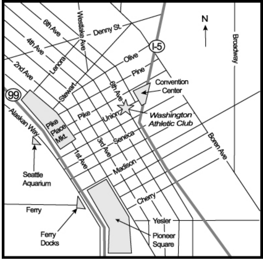
Reprinted with the permission of the Washington Athletic Club